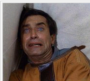
Martin Landau as Rollin Hand on Mission: Impossible , feigning drug dependency