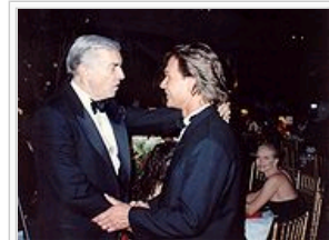
Martin Landau (left) with the late Patrick Swayze